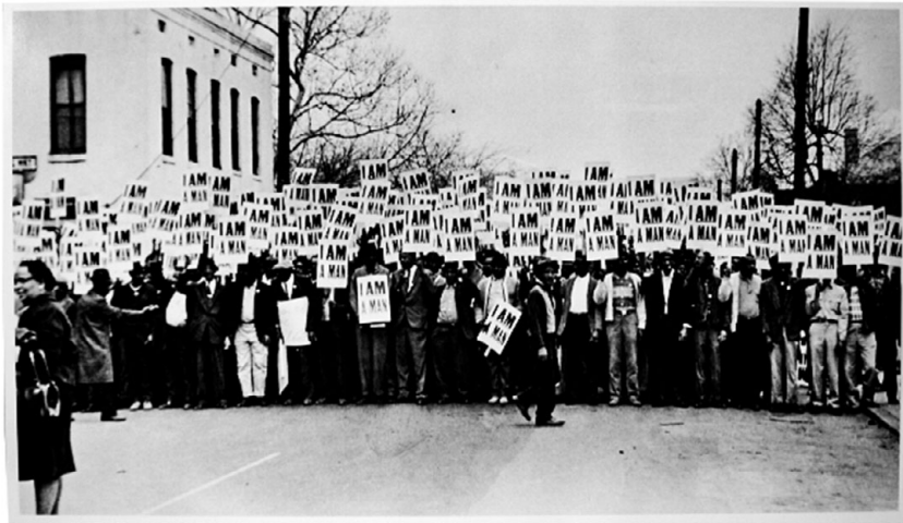
Figure 2. Sanitation workers on strike in Memphis, Tennessee. Ernest C. Withers, 1968. Source: Photograph. The Museum of Fine Arts Houston.

The emergence of an anti-colonial humanism transformed social theory. The Algerian revolution, in which Fanon fought on the side of Algerian independence, was crucial to the formation of poststructural thought. It sparked critical analyses of imperial and racial formations of the human, ushering in an anti-humanism that saw the human as a prejudiced construction of liberal