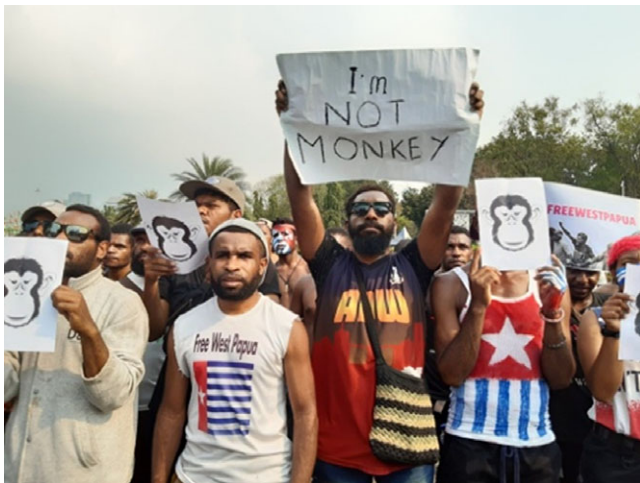
Figure 1. West Papuan activists protesting in Jakarta, Indonesia in August 2019 with signs that read “I’m NOT MONKEY.” Source: https://twitter.com/febprofirdaus/status/1164447634796318720 .

One striking element about the protest was the refusal to be seen or treated as nonhuman animals. On the one hand, declaring “I’m NOT MONKEY” continues a tradition of protest by abolitionist and Black civil rights movements in the Americas. Refusing dehumanization, these protest signs recalled the Wedgwood anti-slavery medallion from 1787, which depicted a chained Black man kneeling with the inscribed words, “Am I Not a Man and a Brother?” 1 It also recalled protest signs wielded by marchers supporting a 1968 sanitation workers’ strike in Memphis, Tennessee. Declaring “I am a man,” these signs affirmed one’s belonging