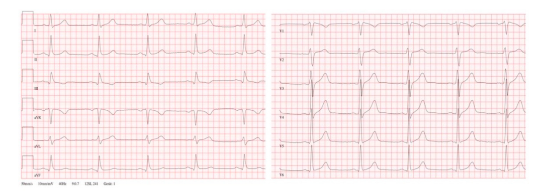
Figure 4. 47 year old male and previously healthy patient with transient Brugada like ECG related to the diagnosis of COVID-19 after recovery. By aggressive antipyretic therapy and supportive peri-infectious therapy the patient recovered within 7 days and the fluctuant Brugada like ECG pattern showed gradual recovery and were in the further ECG recordings not detectable.

Figure 3. 47 year old male and previously healthy patient with transient "Brugada like" ECG pattern in the right precordial leads related to the diagnosis of COVID-19.