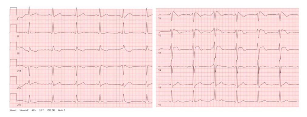
Figure 3. 47 year old male and previously healthy patient with transient "Brugada like" ECG pattern in the right precordial leads related to the diagnosis of COVID-19.