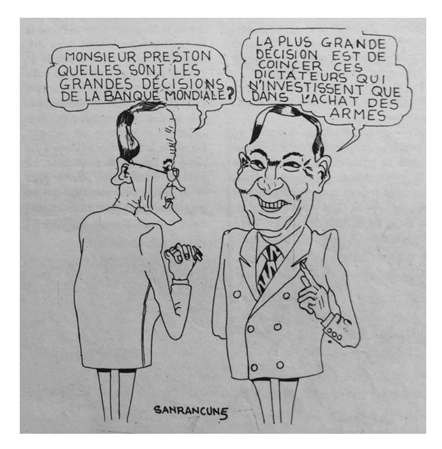
Figure 2. "Les grandes décisions de la Banque Mondiale", La Parole (Lomé, Togo), 23 December 1991, p. 6.

Armées Togolaises were primarily responsible for the failure of the National Conference.<sup>61</sup>