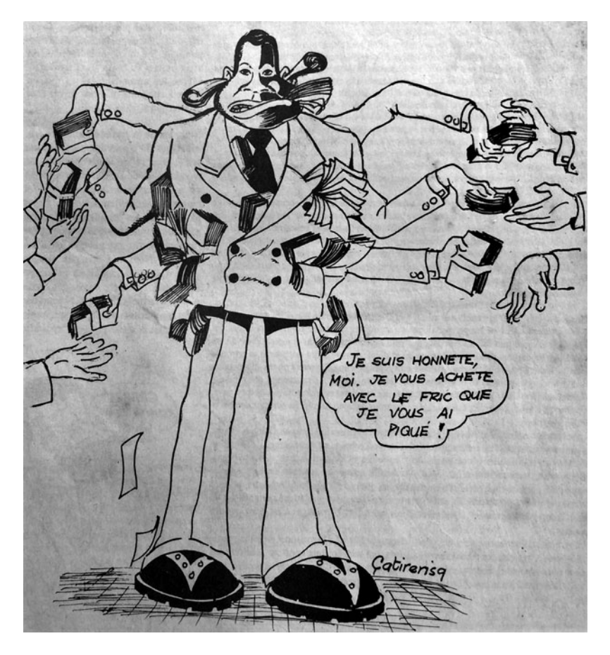
Figure 1. "Conférence nationale ou corruption nationale?", La Parole (Lomé, Togo), 10 July 1991, p. 2.

For decades, "all monies passed through Eyadéma's hands".<sup>45</sup> The street murmurs of the "jeunes conjuncturés" often opposed his excessive luxury. Eyadéma was known for stashing 90 billion CFA francs in Swiss bank accounts.<sup>46</sup> Some cartoonists surrogated the Public Treasury as "Lomé 2", which was the President's residence. Nonetheless, the "flight of Cold War monies, the fallout from the National Conference, and the effects of neo-liberalization" profoundly destabilized Eyadéma's kleptocracy.<sup>47</sup>