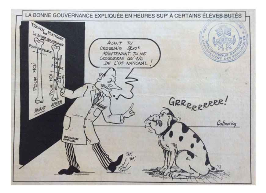
Figure 4. "La bonne gouvernance expliquée en heures sup' à certains élèves butés", Kpakpa Désenchanté (Lomé, Togo), 10 December 1996, p. 3.

not improve the economic situation. The diplomat of the World Bank answers drily: "Privatize the Togolese people".<sup>89</sup>