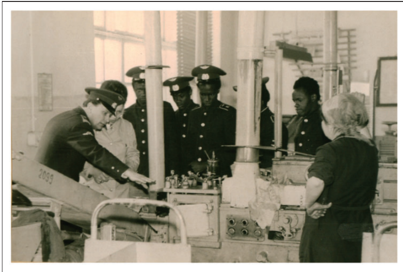
Figure 1. Students from Guinea-Bissau at the Slaviansk Institute of Civil Aviation visiting a factory in October 1975. 44

from the Portuguese colonies was Soviet Ukraine. Female students were trained as nurses at the Kiev or Donetsk schools for medical assistants, whereas men were trained as mechanics in institutions such as the Technical School of Machine-Building in Kharkov or the Institute of Civil Aviation in Slavyansk (see Figure 1).