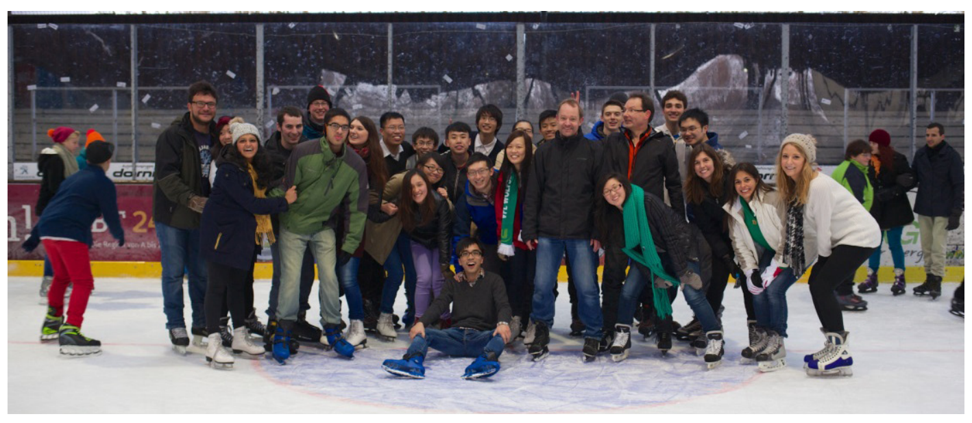
Participants of the international business Case Competition 2014

The International Business Case Competition is an annual event that calls upon teams of undergraduates, from several different disciplines, to reflect upon issues of public interest. They then present the results of this discussion in the form of a business plan. Its 2014 edition took place in the city of Bayreuth, Germany, from the 5th to the 15th January.