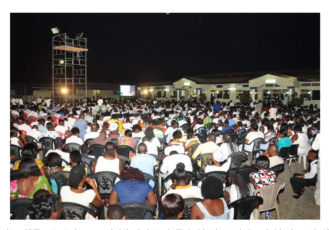
6 Members of RCI praying in the compound of Ahenfie during the Week of the Altar. At the far end of the photo is the Ahenfie Church hall.

Prior to being converted into a church settlement, Ahenfie was a collection of six warehouses owned by a real estate company used mainly to store building equipment. It has since been transformed into a 30,000 square metre property with a 2500 capacity church auditorium (temple), offices for the pastors and staff of the church, youth and children's churches, a Christian leadership college, several warehouses, food vending space, a bookshop, media centre and a large compound with brick flooring and mounted canopies with about a thousand seats to complement the capacity of the main hall. All this is walled and the front part of the wall is a big three-storey office space. The forepart of these offices is a huge private car park also owned by the church. The patrons of these corporate offices do not have access to the main yard of Ahenfie as only the rear of the building forms part of the complex. Next, we shall consider some of the activities associated with Ahenfie as a sacred place and particularly its altar.