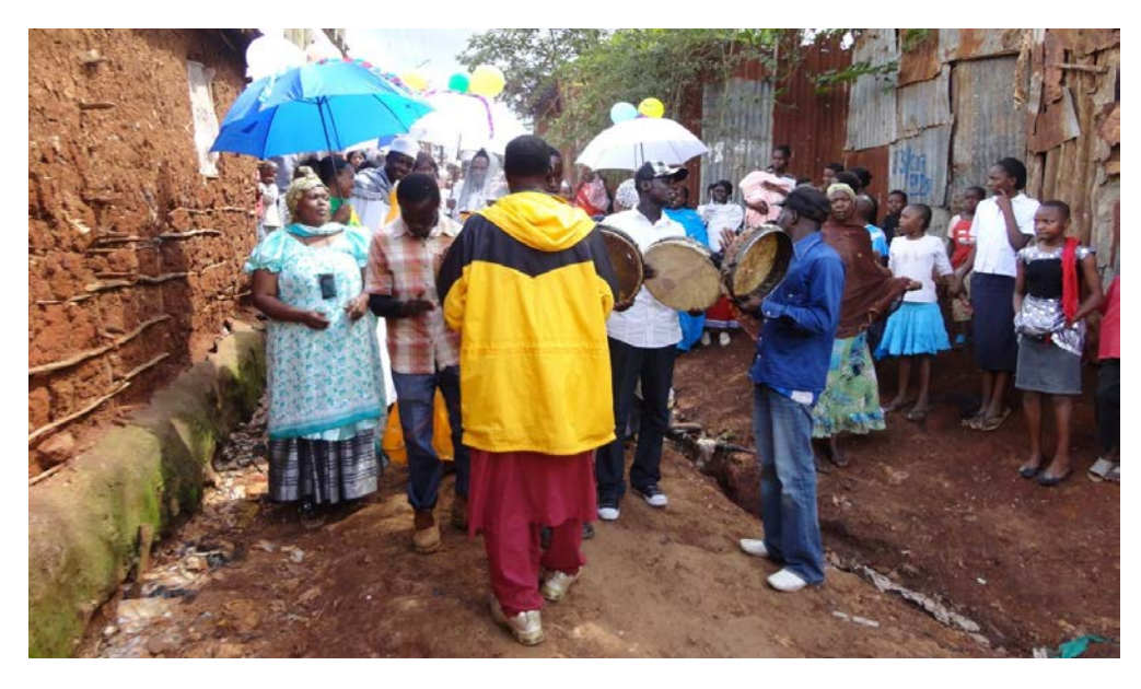
1 Wedding procession in Kibera, the woman on the left wearing the traditional dress called gurbaba.

sion by emphasising belonging".<sup>36</sup> The processions temporarily turn the public space of Kibera's streets into a space of almost inviolable nature, a performance to communicate, legitimize and politicize the Nubi's particular belonging vis-à-vis other inhabitants of the slum.