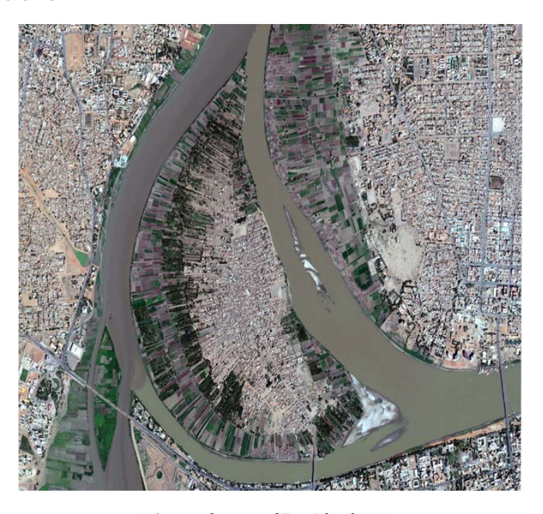
3 An aerial image of Tuti Island 2012<sup>20</sup>