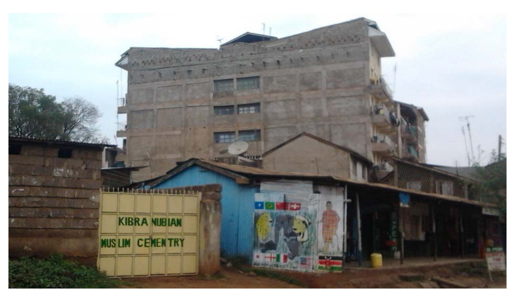
2 The entrance to the Kibra Nubian Muslim 'Cementry' in July 2014.

This new title on the gate encompasses all the aspects of the ongoing negotiations taking place in the multi-ethnic, multi-religious slum that the Nubian community calls their ancestral home. On the one hand, it supports the claim that it is the Nubi community that has a natural, final and long-standing historical relation to this locale. As one of my interlocutors explained to me when visiting the graveyard, the fact that his ancestors had been buried here substantiates Nubi first-comer claims to Kibera and proves that they had -and still have- no other 'ancestral homeland' to fall back on. On the other hand, the inscription also narrows down who is supposed to find a final rest within the settlement's only cemetery. Although my informants stated that in practice, every Muslim who died in the vicinity of the cemetery would be allowed to be buried there, the change of label was a significant one. By focusing on the Nubi community, boundaries of access were redrawn; the space of the cemetery was set apart for people having a share in the religioethnic community.