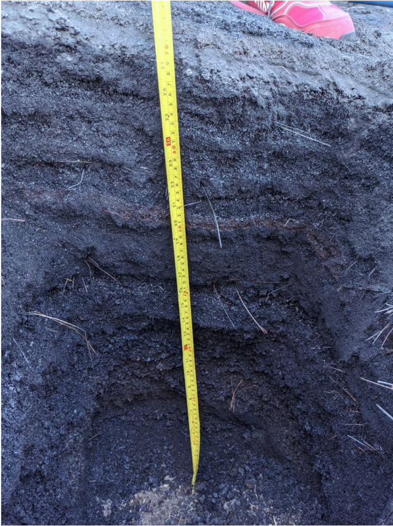
Fig. 3. A sampling hole showing the layering of the tephra to a depth of 68 cm. Occasional needles from Canary Pine ( Pinus canariensis ) that were lost during the eruptive phase are present in the tephra.

the craters. The second product evaluated was a Digital Surface Model (DSM) derived from over 12,000 drone photographs coupled with structure-from-motion photogrammetry [11] with a calculated RMSE of 0.26 m. A digital terrain model (DTM) with 2 m spatial resolution [12] was subtracted from the DSM provided by Civico et al. [11] to derive the surface change due to tephra deposition.