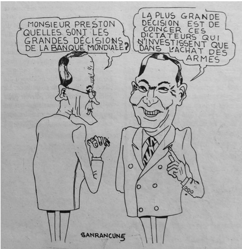
Figure 2. “Les grandes décisions de la Banque Mondiale”, La Parole (Lomé, Togo), 23 December 1991, p. 6.

Armées Togolaises were primarily responsible for the failure of the National Conference. 61