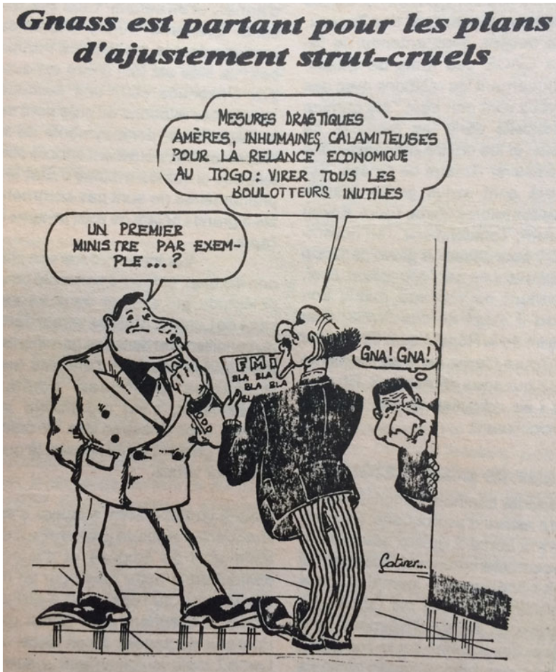
Figure 3. “Gnass est partant pour les plans d’ajustement strut-cruels”, Kpakpa Désenchanté (Lomé, Togo) 16 November 1993, p. 2.

centre”. 64 Kpakpa Désenchanté even invented a slogan for a fictive club of African dictators, the “Union syndicale des dictateurs africains”. 65 The newspapers depicted “Gnass” in concert with other presidents such as Mobuto, alias “Mort Bute”, or Biya as “CorBIYAr”. 66 However, the cartoonists related this