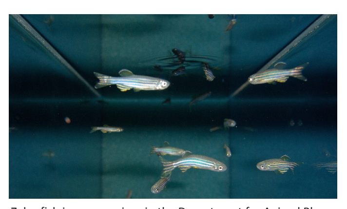
Zebrafish in an aquarium in the Department for Animal Physiology at the University of Bayreuth.

The ability to regenerate or replace large amounts of human nerve cells is a goal being worked towards in countless medical laboratories around the world. Zebrafish are of particular interest. The reason? They have the unusual ability to build new nerve cells and use them to replace dead or damaged ones. It would a great help for neurological research if this phenomenon could not only be observed in living zebrafish, but also be reproduced and researched in a test tube. However, all the methods used up until now to grow artificial Zebrafish nerve cell cultures have proved to be both labour intensive and time