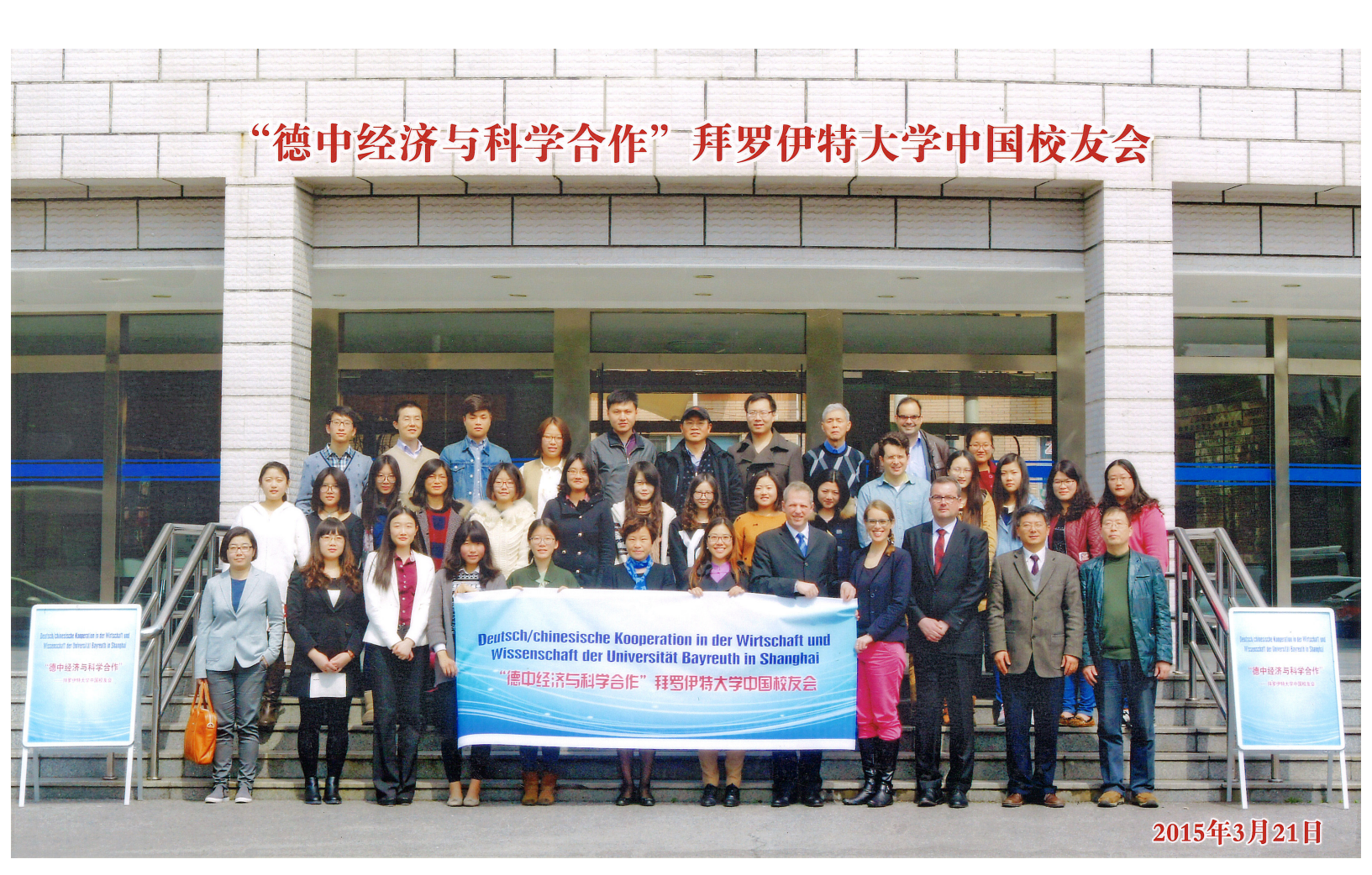
Alumni Event in Shanghai